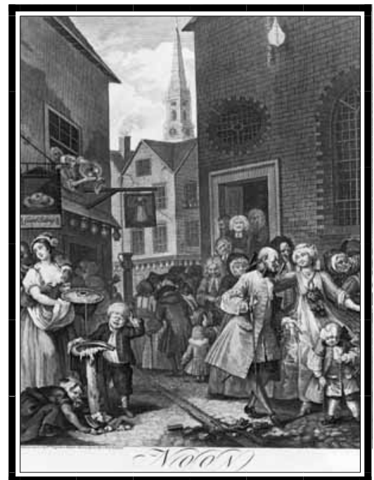
By William Hogarth

Social status is reflected in appearance and an eighteenth century person was expected to appear in a manner consonant with his (or her) place in society. The clothing of the wealthy of that age might even surpass our own for comfort, but the mass of people lived an uncomfortable and itchy existence.