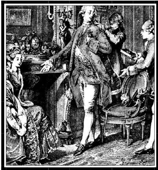
18th Century Tailor at Work

As those of us who experience eighteenth century life in very small doses might suspect, people who actually lived in that age had very different concepts of comfort than we do with our climate controlled homes and cars. It was an era that had no knowledge of off-the-rack clothing. All clothing was custom-made for a particular wearer. If an individual was fairly wealthy, he or she wore not only clothing but also footwear made for his or her particular shape.