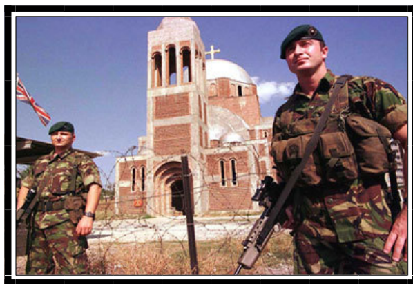
Royal Marines at Work in Iraq

I’ve hitched a number of rides on helicopters in order to improve my knowledge of the Basra area. The disadvantage about being so low down the food chain is that there are limited transport assets, so I have to grab anything that’s going my way. On the other hand, the joy about being ‘Media’ is that one can scrounge rides from the highest ranks, as they automatically think that you’re going to focus your report on them. Of course, I shamelessly encourage them in this belief. “